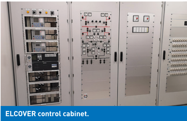
ELCOVER control cabinet.