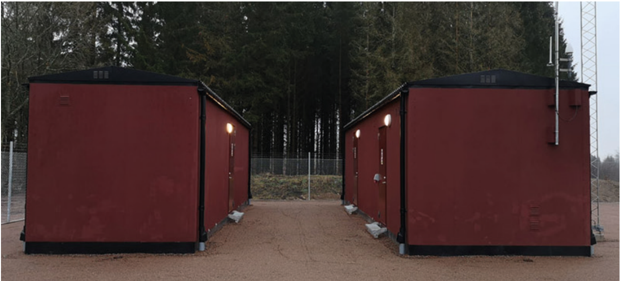
E.ON Tåstarp, a new 20–10 kV station with CombiFLEX.